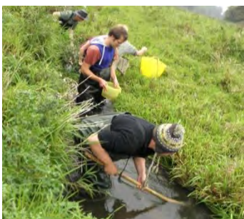
Volunteers catching white-clawed crayfish