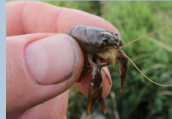
First juvenile crayfish to be found in an ark site river for twenty years.

We have been monitoring these populations to check how they are doing so far we have only found low numbers. This is to be expected at this early stage. After reintroduction it is thought that it may take crayfish five years to become established. In this period there is a greater risk of dying out so it is important to keep monitoring and take action when necessary.