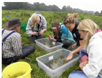
White-clawed crayfish have a health check by volunteers