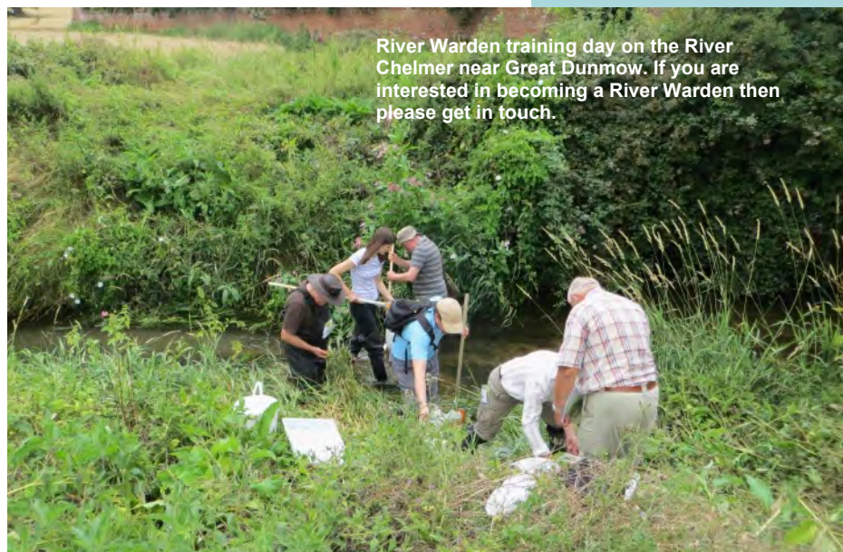
River Warden training day on the River Chelmer near Great Dunmow. If you are interested in becoming a River Warden then please get in touch.